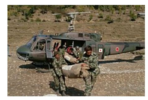
A <u>JGSDF</u> Bell-Fuji UH-1H conducting <u>Kashmir earthquake</u> relief activities (2005)

The aircraft are also used to conduct <u>water bombing</u> against fires. [55][56]