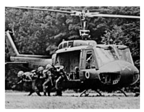
A rifle squad from the <u>1st Squadron</u>, 9th Cavalry exiting from a UH-1D.

During service in the Vietnam War, the UH-1 was used for various purposes and various terms for each task abounded. UH-1s tasked with ground attack or armed escort were outfitted with rocket launchers, grenade launchers, and machine guns. As early as 1962, UH-1s were modified locally by the companies themselves, who fabricated their own mounting systems. These gunship UH-1s were commonly referred to as "Frogs" or "Hogs" if they carried rockets, and "Cobras" or simply "Guns" if they had guns. [20][21][N 4][22] UH-1s tasked and configured for troop transport were often called "Slicks" due to an absence of weapons pods. Slicks did have door gunners, but were generally employed in the troop transport and medevac roles. [8][13]