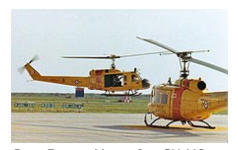
Base Rescue Moose Jaw CH-118 Iroquois helicopters at <u>CFB Moose</u> <u>Jaw</u>, 1982