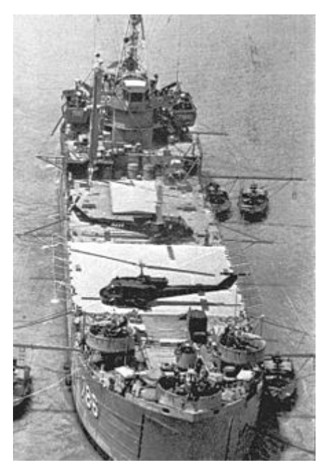
Two UH-1B Huey gunships from HAL-3 "Seawolf" sit on the deck of USS Garrett County in Mekong Delta, South Vietnam.

During the 1972 Easter offensive by North Vietnam, experimental models of the TOW-firing XM26 were taken out of storage and sent to South Vietnam to help stop the onslaught. The pilots had never fired a TOW missile before, and were given just crash courses. Despite having little training with the units, the pilots managed to hit targets with 151 of the 162 missiles fired in combat, including a pair of tanks. The airborne TOW launchers were known as "Hawks Claws" and were based at Camp Holloway. During the war 7,013 UH-1s served in Vietnam and of these 3,305 were destroyed. In total 1,074 Huey pilots were killed, along with 1,103 other crew members.