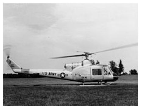
A Bell XH-40, a prototype of the UH-

In 1952, the U.S. Army identified a requirement for a new helicopter to serve as medical evacuation (MEDEVAC), instrument trainer, and general utility aircraft. The Army determined that current helicopters were too large, underpowered, or too complex to maintain easily. In November 1953, revised military requirements were submitted to the Department of the Army. Twenty companies submitted designs in their bid for the contract, including Bell Helicopter with the Model 204 and Kaman Aircraft with a turbine-powered version of the H-43. On 23 February 1955, the Army announced its decision, selecting Bell to build three copies of the Model 204 for evaluation with the designation XH-40.