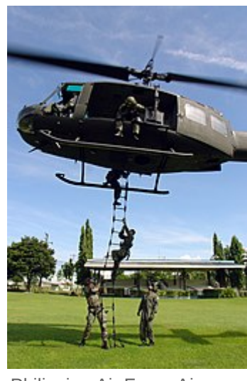
Philippine Air Force Airmen with the 6th SOS unit of the USAF during a bilateral exercise