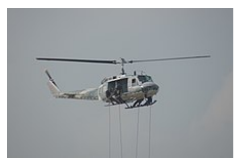
Royal Thai Air Force special operation troops <u>rappel</u> from UH-1 during a demonstration on Children day 2013