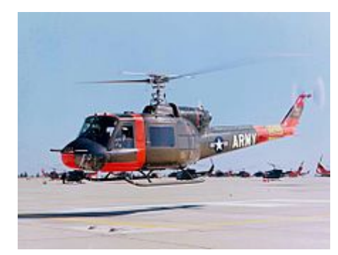
UH-1A Iroquois in flight