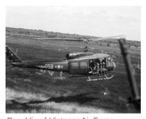
Republic of Vietnam Air Force (VNAF) UH-1H lands during a combat mission in Southeast Asia in 1970

In October 1965, the <u>United States Air Force</u> (USAF) <u>20th Helicopter Squadron</u> was formed at <u>Tan Son Nhut Air Base</u> in South Vietnam, equipped initially with <u>CH-3C</u> helicopters. By June 1967 the UH-1F and UH-1P were also added to the unit's inventory, and by the end of the year the entire unit had shifted from Tan Son Nhut to <u>Nakhon Phanom Royal Thai Air Force Base</u>, with the CH-3s transferring to the <u>21st Helicopter Squadron</u>. On 1 August 1968, the unit was redesignated the 20th Special Operations Squadron. The 20th SOS's UH-1s were known as the Green Hornets , stemming from their color, a primarily green two-tone camouflage (green and tan) was carried, and radio call-sign "Hornet". The main role of these helicopters were to insert and extract reconnaissance teams, provide cover for such operations, conduct psychological warfare, and other support roles for <u>covert operations</u> especially in Laos and Cambodia during the so-called Secret War. [32]