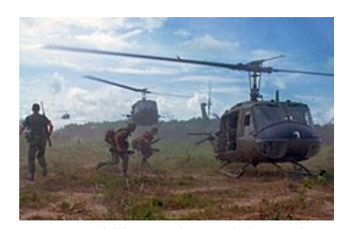
UH-1Ds airlift members of the 2nd Battalion, 14th Infantry Regiment from the Filhol Rubber Plantation area to a staging area in 1966.

The HU-1A (later redesignated UH-1A) first entered service with the 101st Airborne Division at Fort Campbell, Kentucky, the 82nd Airborne Division, and the 57th Medical Detachment. Although intended for evaluation only, the Army quickly pressed the new helicopter into operational service, and Hueys with the 57th Medical Detachment arrived in Vietnam in March 1962. [13] The UH-1 has long been a symbol of US involvement in Southeast Asia in general and Vietnam in particular, and as a result of that conflict, has become one of the world's most recognized helicopters. In Vietnam primary missions included general support, air assault, cargo transport, aeromedical evacuation, search and rescue, electronic warfare, and later, ground attack. During the conflict, the craft was upgraded, notably to a larger version based on the Model 205. This version was initially designated the UH-1D and flew operationally from 1963.