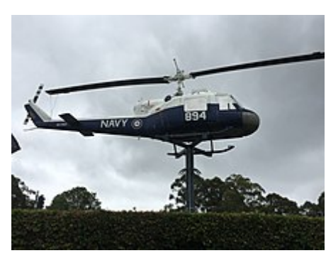
An <u>RAN</u> UH-1B pole-mounted at Nowra

5th Aviation Regiment based in Townsville, Queensland following the decision that all battlefield helicopters would be operated by the Australian Army. On 21 September 2007, the Australian Army retired the last of their Bell UH-1s. The last flight occurred in Brisbane on that day with the aircraft replaced by MRH-90 medium helicopters and Tiger armed reconnaissance helicopters.