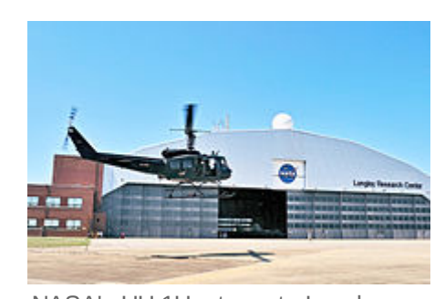
NASA's UH-1H returns to Langley after supporting space shuttle operations at Kennedy Space Center.