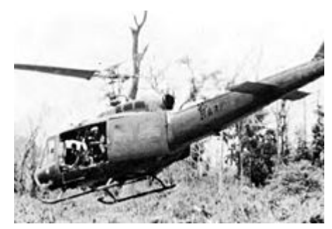
A 9 Sqn UH-1D in Vietnam, 1970

in various roles through the 1970s and 1980s. Between 1982 and 1986, the squadron contributed aircraft and aircrew to the Australian helicopter detachment which formed part of the Multinational Force and Observers peacekeeping force in the Sinai Peninsula, Egypt. [43] In 1988 the RAAF began to re-equip with S-70A Blackhawks.