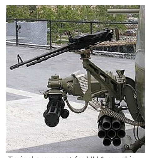
Typical armament for UH-1 gunship

The UH-1H also features a synchronized elevator on the tail boom, which is linked to the cyclic control and allows a wider center of gravity range. The standard fuel system consists of five interconnected fuel tanks, three of which are mounted behind the transmission and two of which are under the cabin floor. The landing gear consists of two arched cross tubes joining the skid tubes. The skids have replaceable sacrificial skid shoes to prevent wear of the skid tubes themselves. Skis and inflatable floats may be fitted. [18]