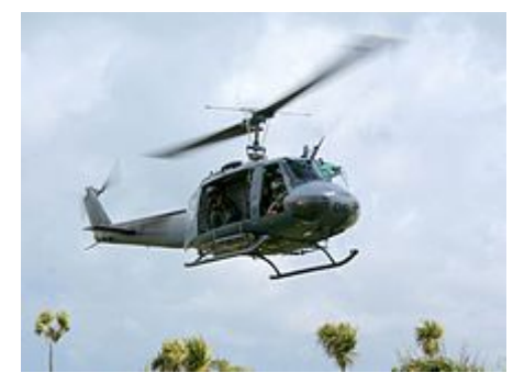
A Royal New Zealand Air Force No. 3 Squadron UH-1H Iroquois, November 2009

The RNZAF is currently in the process of retiring the Iroquois. The NHIndustries NH90 has been chosen as its replacement, eight active NH90 helicopters plus one spare are being procured. This process was initially expected to be completed by the end of 2013, but was delayed until 2016. Individual aircraft were retired as they reach their