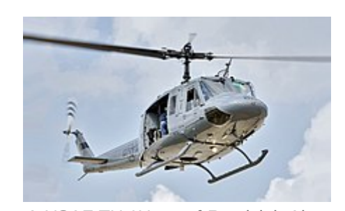
A <u>USAF</u> TH-1H out of <u>Randolph Air</u> Force Base, 2005