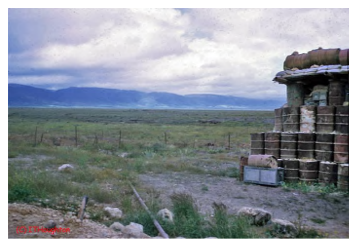
Figure 6. Hedgehog B during the monsoon looking towards the jebel.