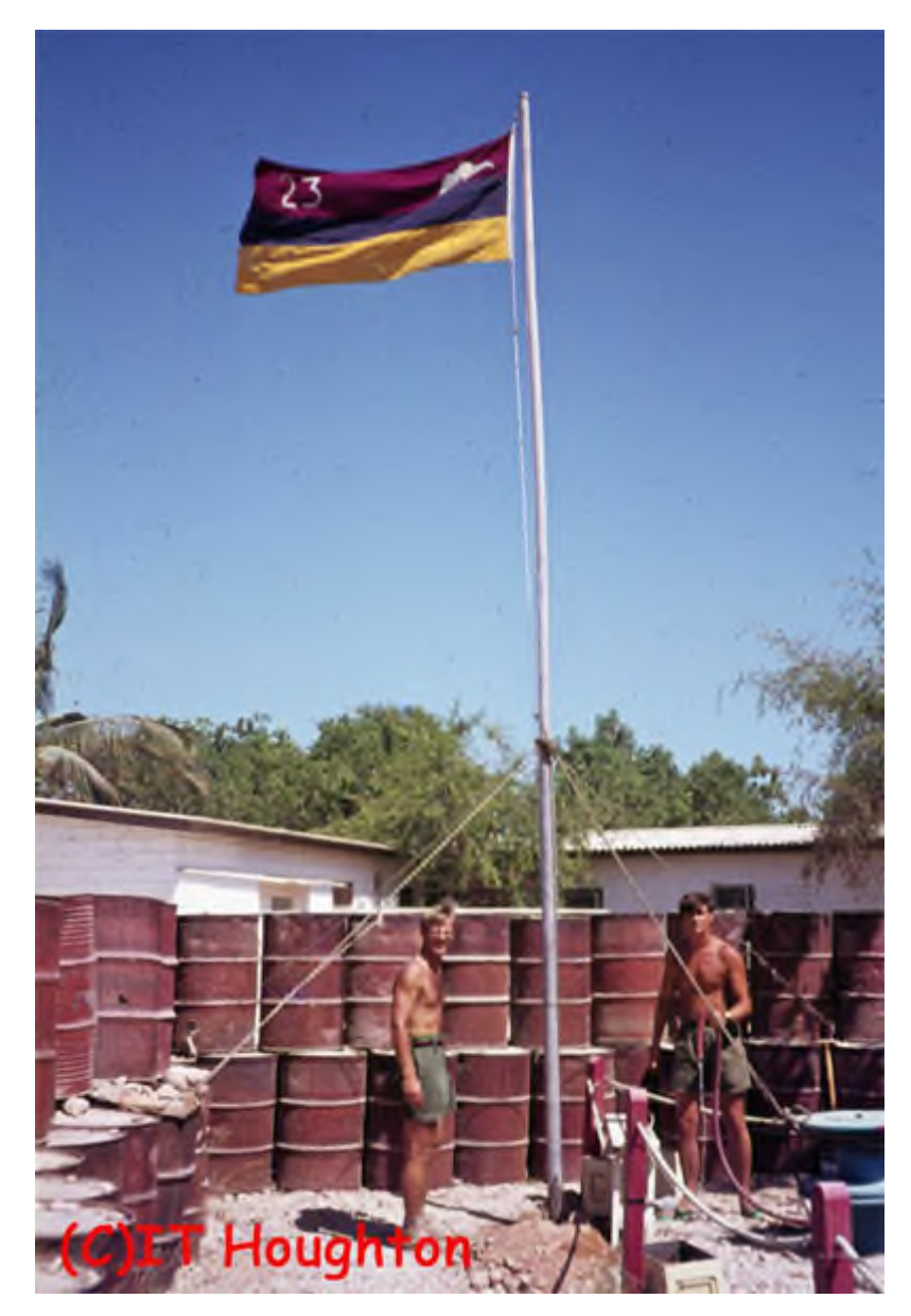
Figure 14. Flag of 23 Para Fd Amb flies above the FST.

The previous team had adopted a stray dog 'Bondu' and we continued to look after him until he was killed in an RTA.