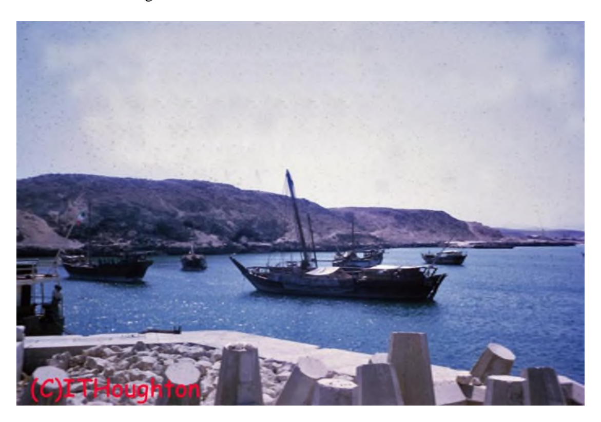
Figure 10. Rhayzuit harbour 1975.

I had volunteered for service with special forces and it was agreed by the Army Medical Directorate that I should do 22 SAS Selection in early 1975 followed by the continuation training. However, in the meantime, the para FST of 23 Para Fd Amb was chosen for service in Dhofar. I felt that I should accompany them, so I went out to Salalah a couple of weeks after the rest of the team (my unlucky predecessor having to wait behind until my arrival) having completed selection but not doing the continuation training.