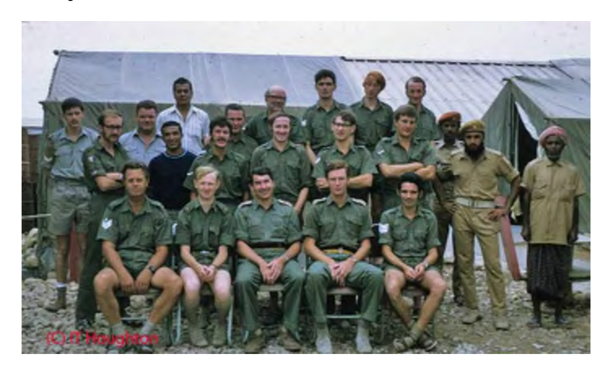
Figure 1. 55 FST (5)