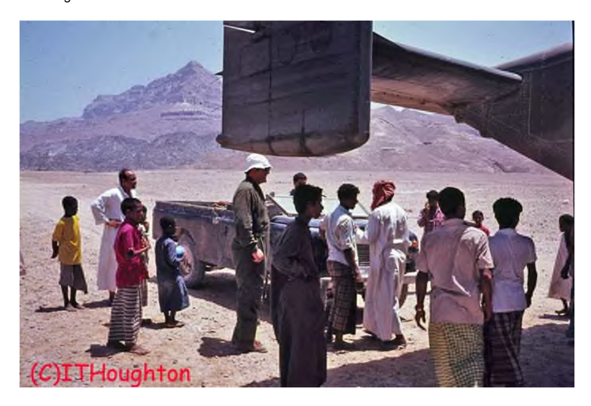
Figure 8. Skyvan on the jebel.

We were always made very welcome and were given honorary membership of the Taylor Woodrow Club as well as the Airworks Canteen on site. Visits were made to the local hospital, the Royal Salalah Hospital and movement was facilitated by the prior gift of a Suzuki miniature four wheel drive SUV that ran on fuel from the Sultan's Armed Forces petrol pump and, therefore, was not so tied up in red tape and vehicle work sheets as the RAF vehicles.