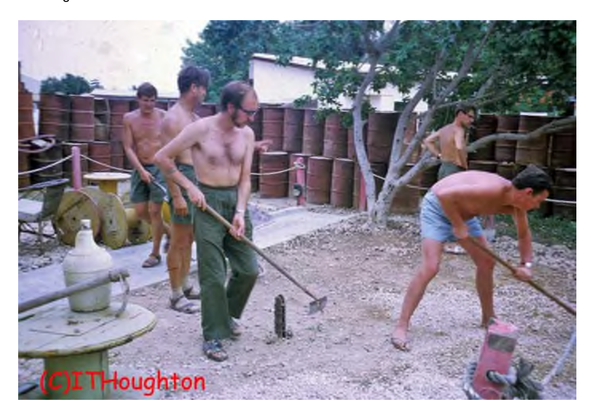
Figure 7. Gardening at the FST.

We made good use of the excellent swimming pool and regularly used to run around the track as well as play volley ball and visit the beaches. However, within two or three weeks, the monsoon arrived and the beach was much less attractive. The rain made the desert fertile and we spent quite a lot of time creating a garden and improving the environs of the FST. I used to take the opportunity during quiet times to visit most of the outside locations on the jebel either by helicopter, Sky van or Caribou.