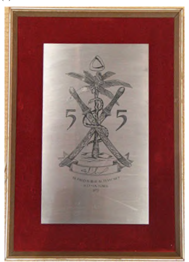
Figure 2. 55 FST (5) Logo