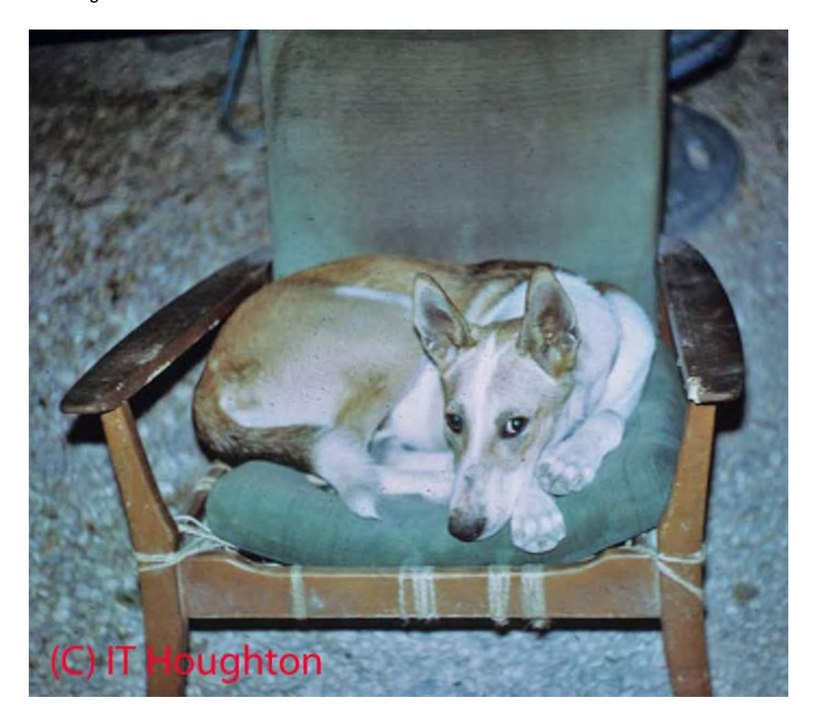
Figure 15. 'Bondu'.