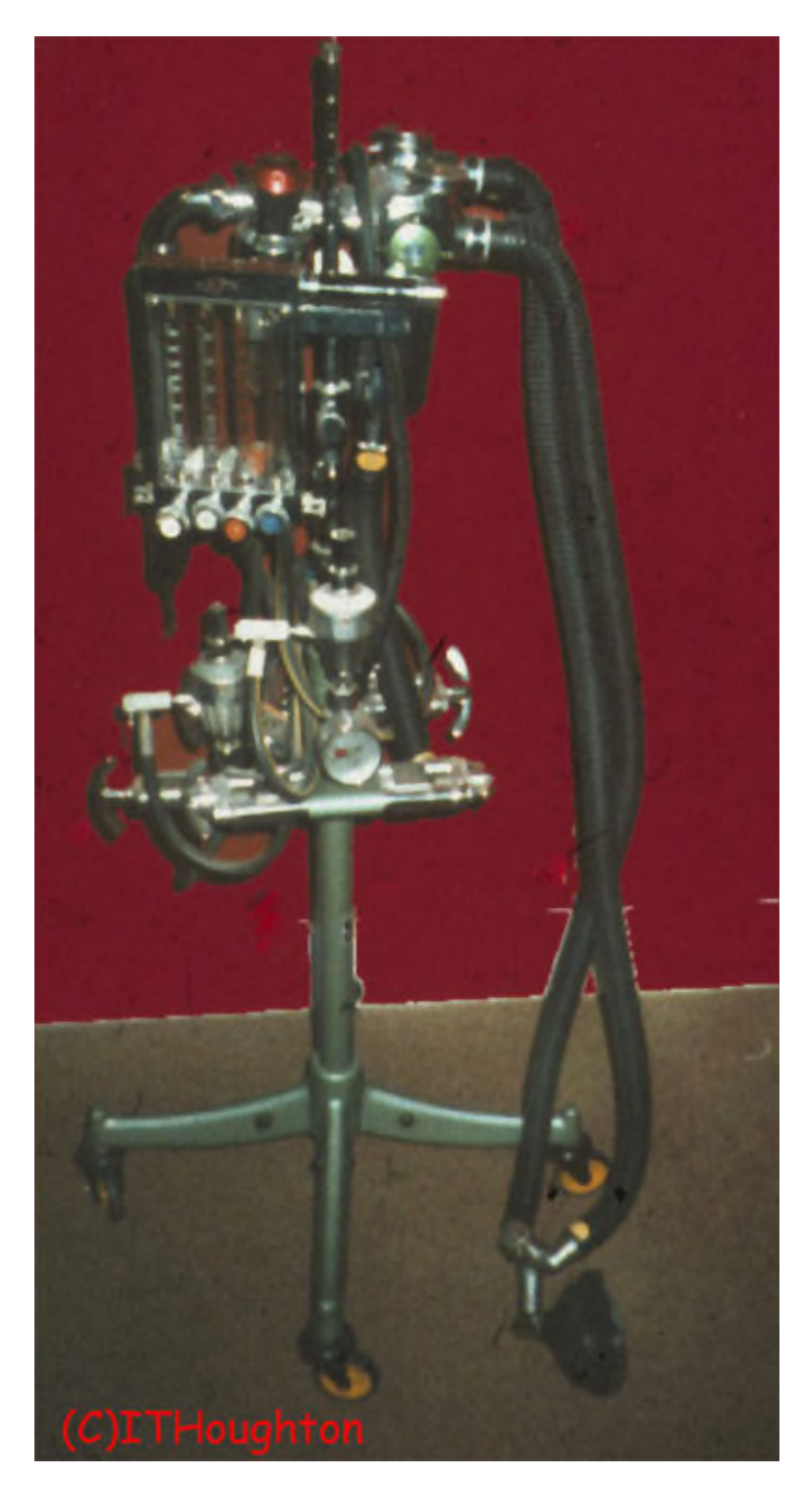
Figure 4. M and IE Services Transportable Model anaesthetic apparatus. An analysis of the anaesthetics given is recorded in a paper by Knight and Houghton (1981). I kept personal records of all my anaesthetics on my own forms as well as the official service record. Particular note was taken of induction and recovery times as